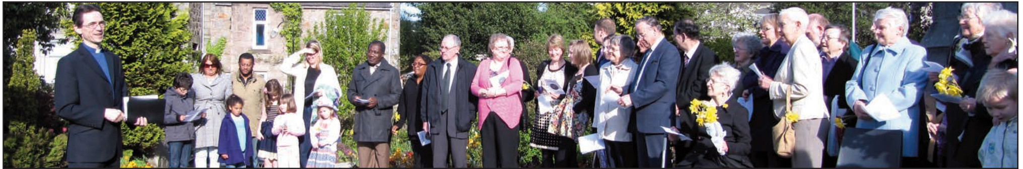
Easter Sunday at South Holburn: at the outdoor 9.45am service (above) and after the 10.30am service (below)